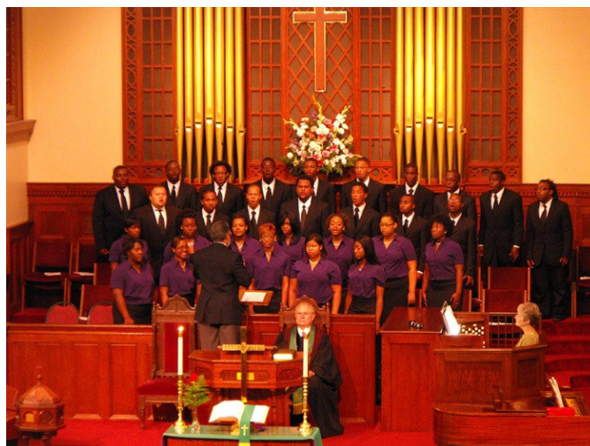
Wiley A Capella Choir at Marsharl First UMC